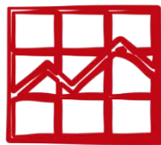
2. Test the Feasibility