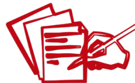
4. Complete the Transfer