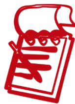
3. Structure the Transaction