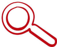
1. Outline Objectives

There are five basic steps to transferring your business to your employees: