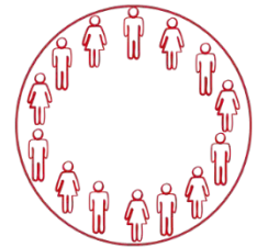
5. Operate as a Democratic Firm

ICA is the foremost firm designing employee ownership for small businesses. We have been instrumental in transactions in a variety of industries and for companies ranging in value from less than $1 million to more than $20 million in value.